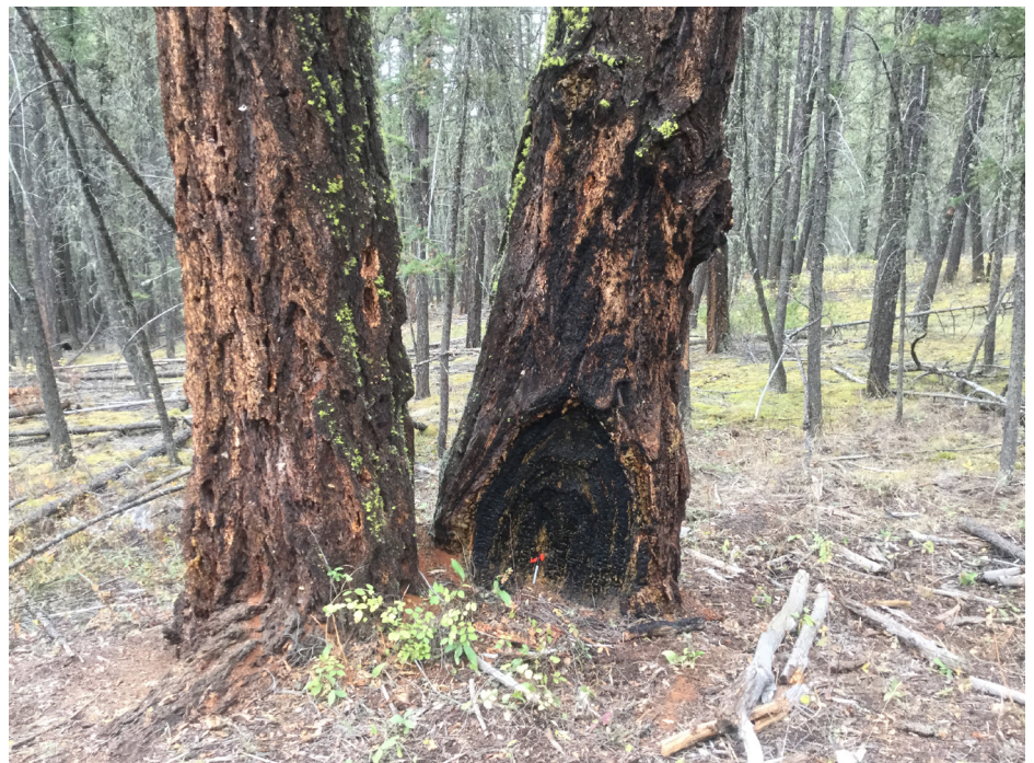
Figure 1: Fire-scarred tree with at least 12 visible fire scars at Ne SEXTSINE . Although this tree could have been "convenience" sampled, we intentionally left it intact as it was the sole fire-scarred tree located along an important travel corridor for the T'exelc.

A key element of our collaborative research was co-developing data collection methods (Wong et al. 2020). Tree-ring research is inherently extractive because we access land and collect, remove, and usually archive material at research institutions. To address this challenge, the sampling methods were guided by archaeological best practice (by WS) and the T'exelc Elders. This included avoiding culturally modified trees and archaeological sites that are protected by the BC Forest and Range Practices Act and the Heritage Conservation Act. However, these legal frameworks have limitations, such as no protection for sites dating after 1846 (the year in which BC claimed sovereignty) and a lack of comprehensive site records (Schaepe et al. 2020). Given these limitations, WS and the Elders specifically provided permission